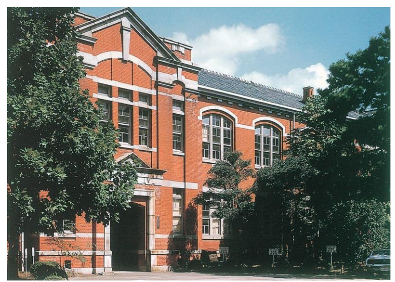
Old memorial building of the Civil Engineering Department